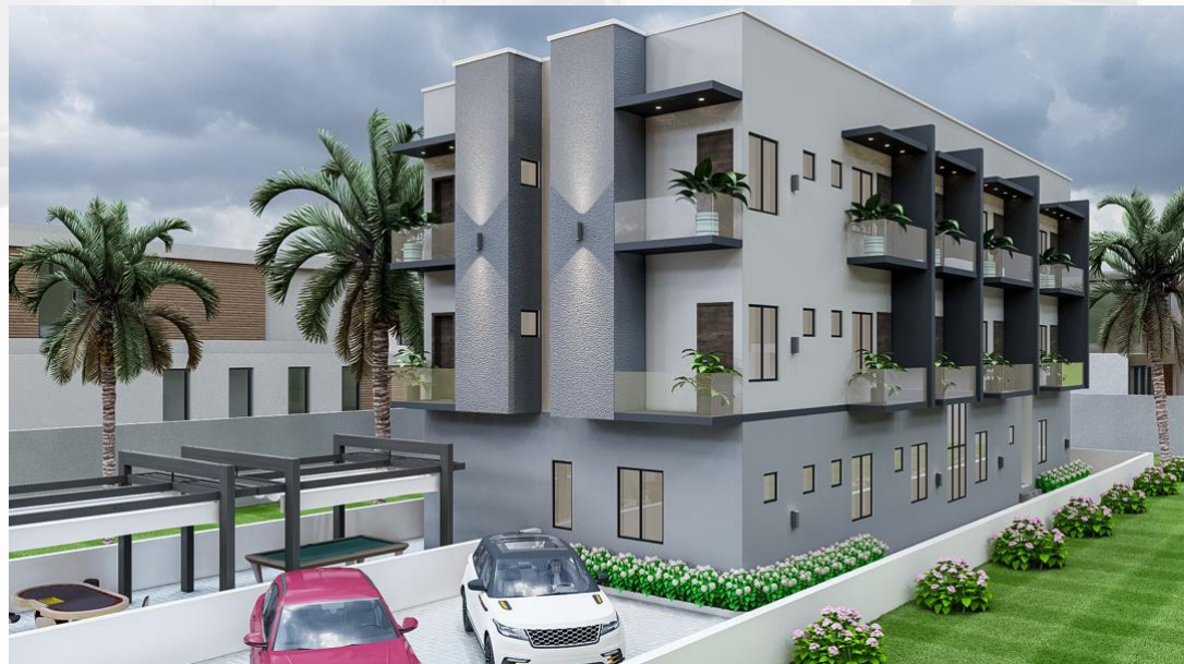
14, Onafowokan street Somolu

We collaborate closely with our clients to fully grasp their needs and provide projects that will be effective for many years to come.