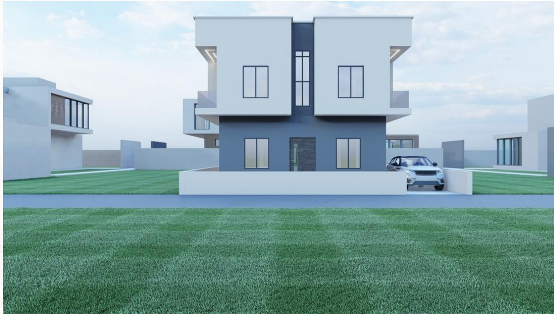
2, Alhaji Kalejaye street. Somolu